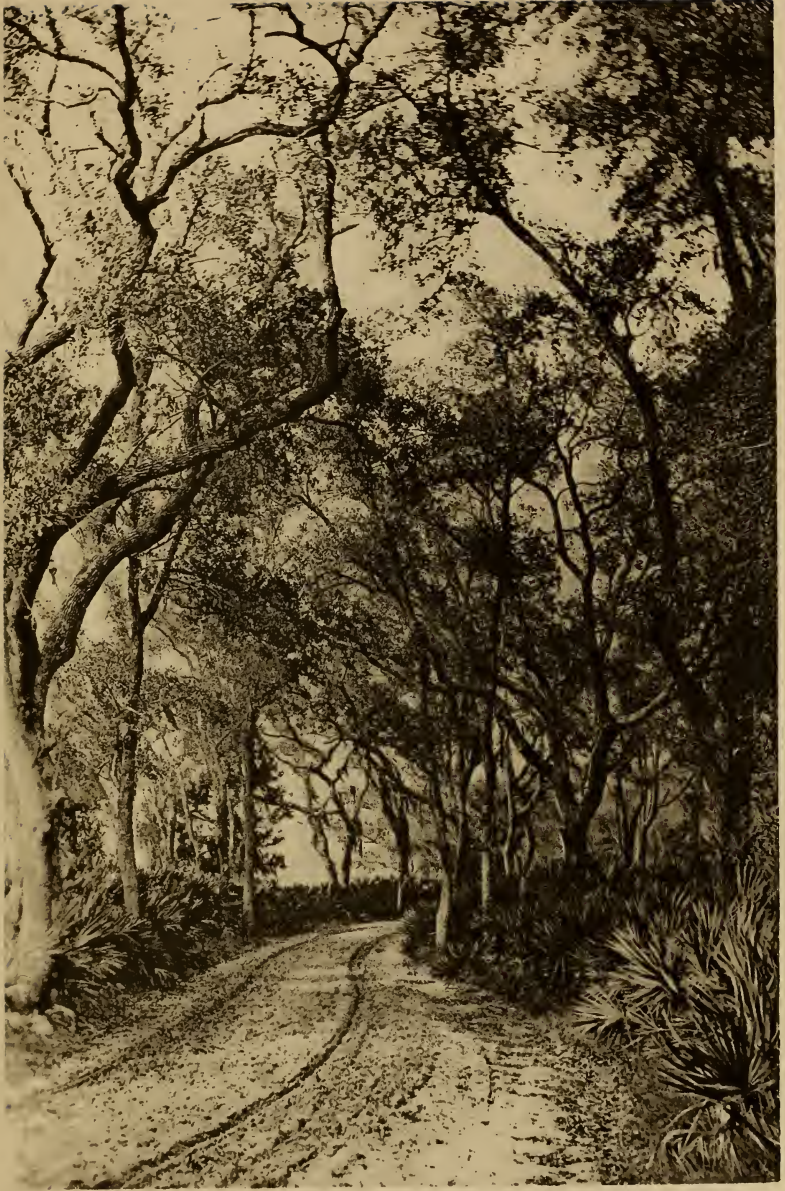
OGLETHORP NEAR LEDGE POND